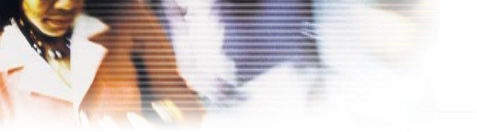
Table 7 provides examples of activities which can support the assessment or development of Employability Skills. While activities are matched to specific Employability Skills, it is possible that a single activity may in fact apply to more than one.